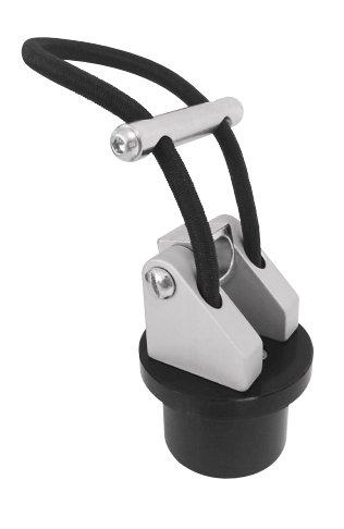
Bazooka Spreader End Block