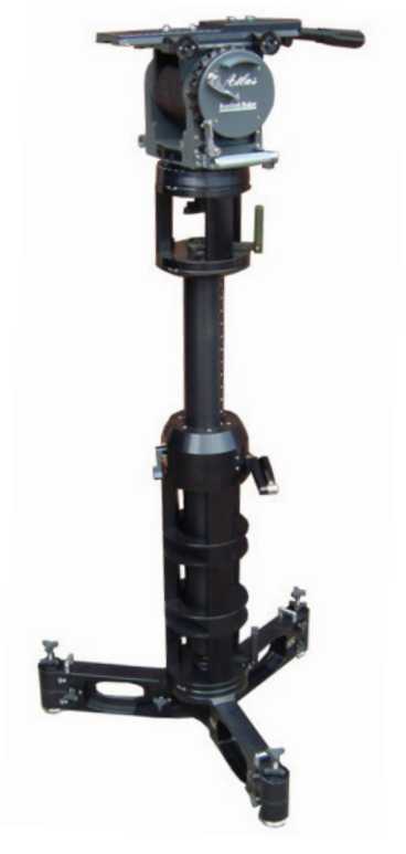
Base/24"-40" Wind Up/Atlas

Castor wheels and skate bogies are also available