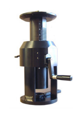
12" -16" Riser

Three-leg design using a custom extrusion, CNC machined billet alloy components and high-tensile stainless steel provide massive strength, high torsional rigidity and no rust. The no-welding construction allows for easy repair.