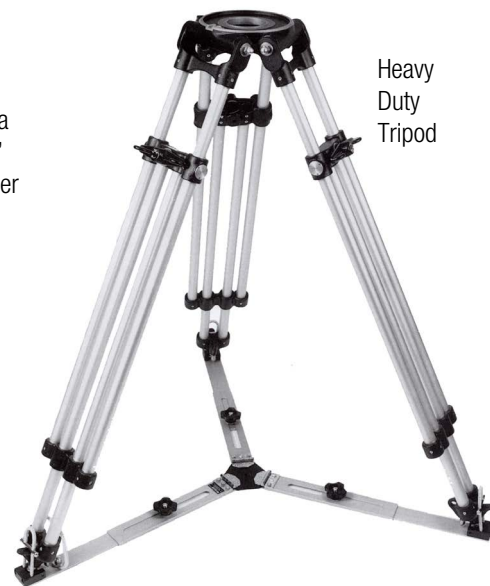
Heavy Duty Tripod