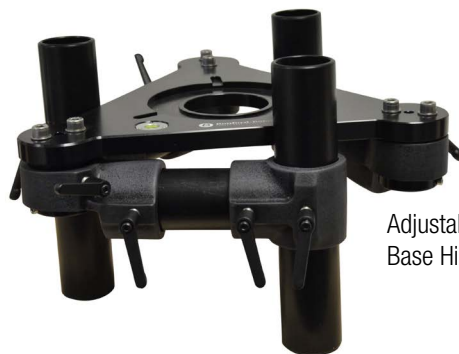
Adjustable Mitchell Base Hi-hat