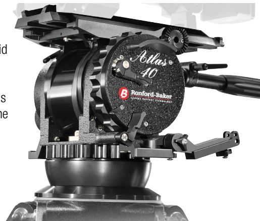
New Atlas 40 Fluid Head: 7 pan and tilt fluid settings with zero positions at either end of the scale. Tilt range + - 90 degrees; Weight: 9 kg.