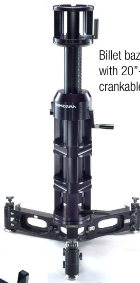
Billet bazooka with 20"-40" crankable riser