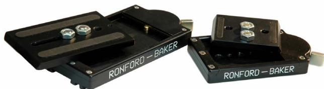
Standard and Large Quick-Release (Euro-style) Plates and Bases