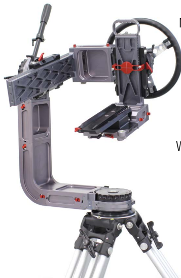
New Atlas 7 half-gimbal Fluid Head for self-balanced control of cameras up to 60 kg, upright or underslung. Modular construction, also available in 3 axis. Weight (2 axis): 14.5 kg.