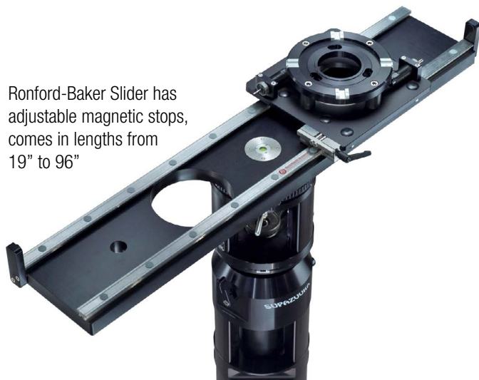
Ronford-Baker Slider has adjustable magnetic stops, comes in lengths from 19" to 96"