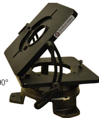
Tilttable Hi-hat has a Mitchell base with 4 keyways, adjusts to 90°